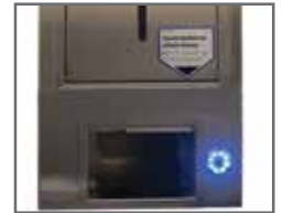
RECESSED AUTOMATIC PAPER DISPENSER