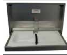
RECESSED BABY CHANGING TABLE