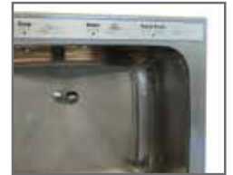
TOUCH FREE SENSOR OPERATED BASIN