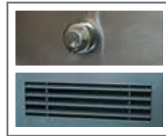
AUTO WASH AND FLOOR DRYING