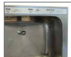
TOUCH FREE SENSOR OPERATED BASIN