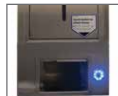
RECESSED AUTOMATIC PAPER DISPENSER