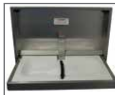
RECESSED BABY CHANGING TABLE