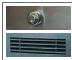
AUTO-WASH AND FLOOR DRYING