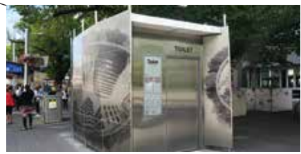
Photo Film Overlay

Customise the exterior finish to meet the needs of your project.