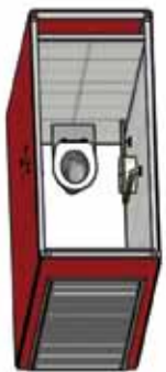
SMALL 2400h x 2300d x 1100w

Cost effective flexible building design to meet your needs!