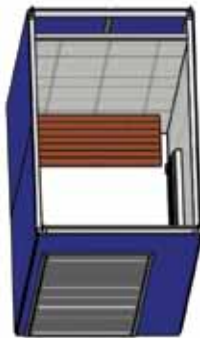
MEDIUM 2400h x 2300d x 1600w