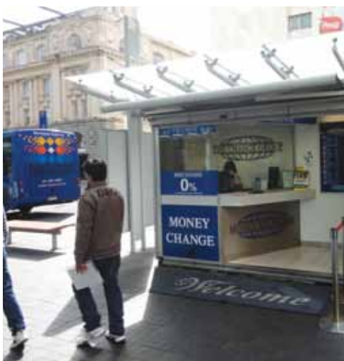
Ecoloo Kiosk - Auckland, New Zealand