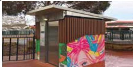
Photo Film Overlay

Customise the exterior finish to meet the needs of your project.