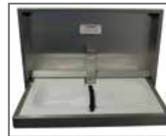
RECESSED BABY CHANGING TABLE