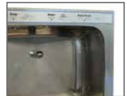
TOUCH FREE SENSOR OPERATED BASIN