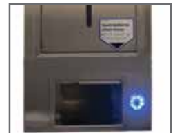
RECESSED AUTOMATIC PAPER DISPENSER