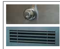
AUTO WASH AND FLOOR DRYING